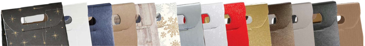
(CON) (WHI) (NAV) (NAT) (WOO) (SNO) (ARG) (SBI) (PRO) (ORO) (PMA) (GRI) (NER) (TAW)