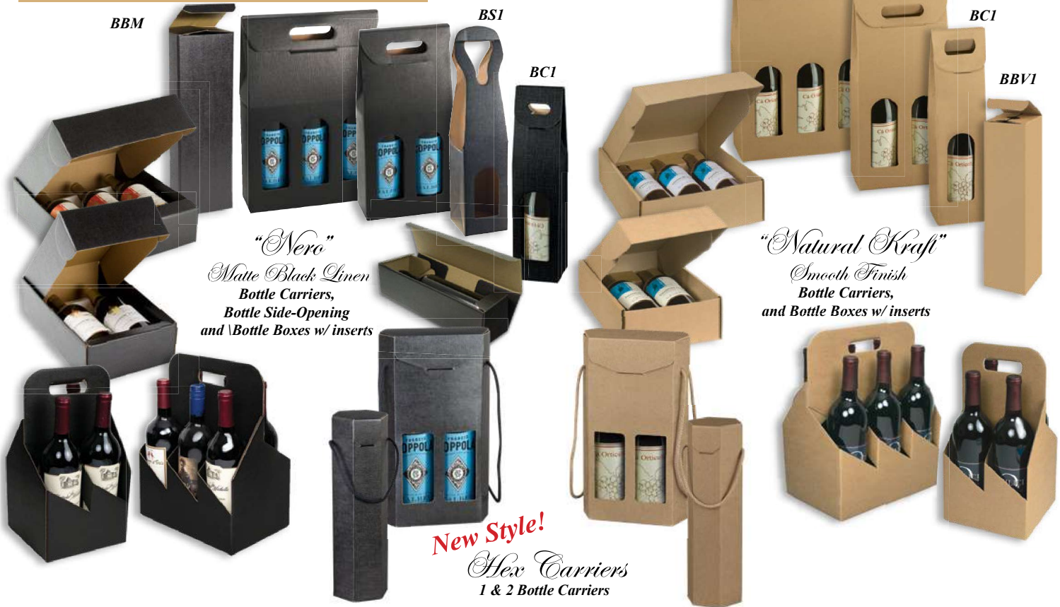
"Nero" Matte Black Linen Bottle Carriers, Bottle Side-Opening and \Bottle Boxes w/ inserts