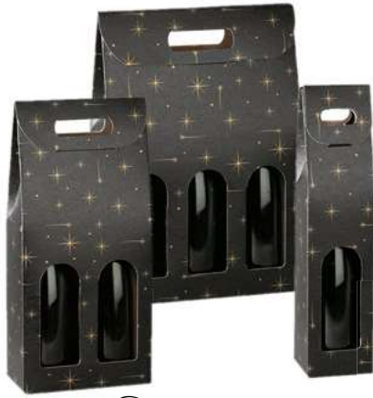
"Constellation" Smooth Finish 1, 2 & 3 Bottle Carriers