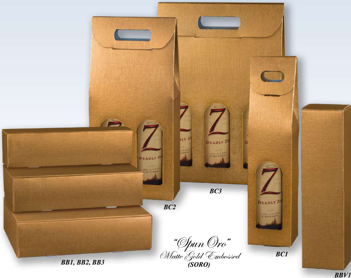
BB1, BB2, BB3