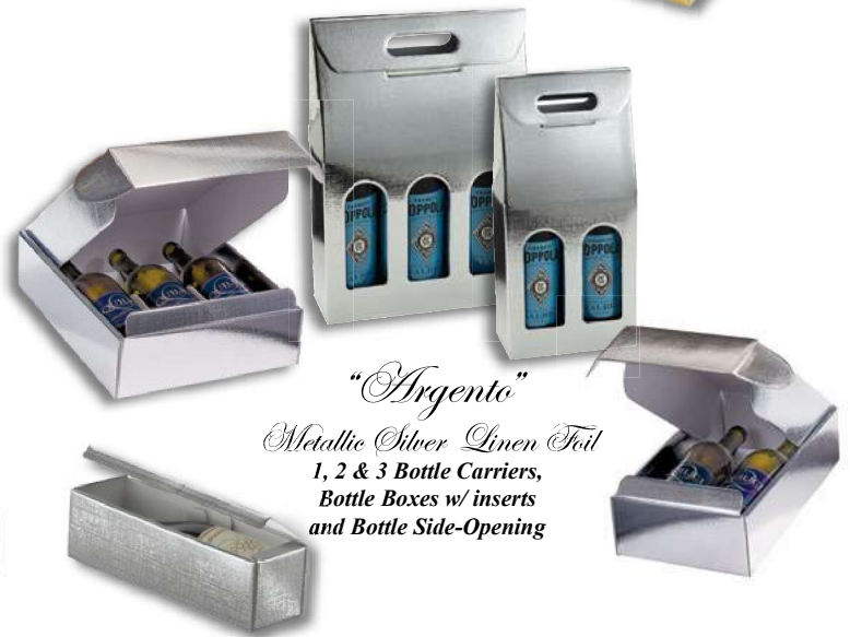
“Argento” Metallic Silver Linen Foil 1, 2 & 3 Bottle Carriers, Bottle Boxes w/ inserts and Bottle Side-Opening