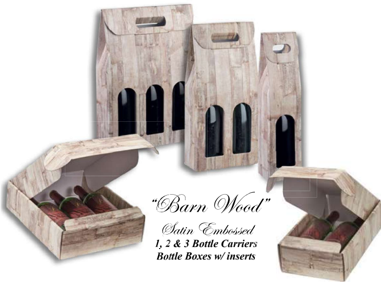
“Barn Wood” Satin Embossed 1, 2 & 3 Bottle Carriers Bottle Boxes w/ inserts