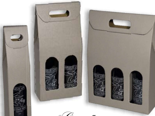
"Grigio" Gray Groove 1, 2 & 3 Bottle Carriers