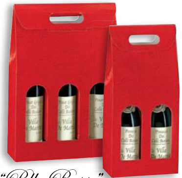
"Pelle Rosso" Red Pebble 2 & 3 Bottle Carriers