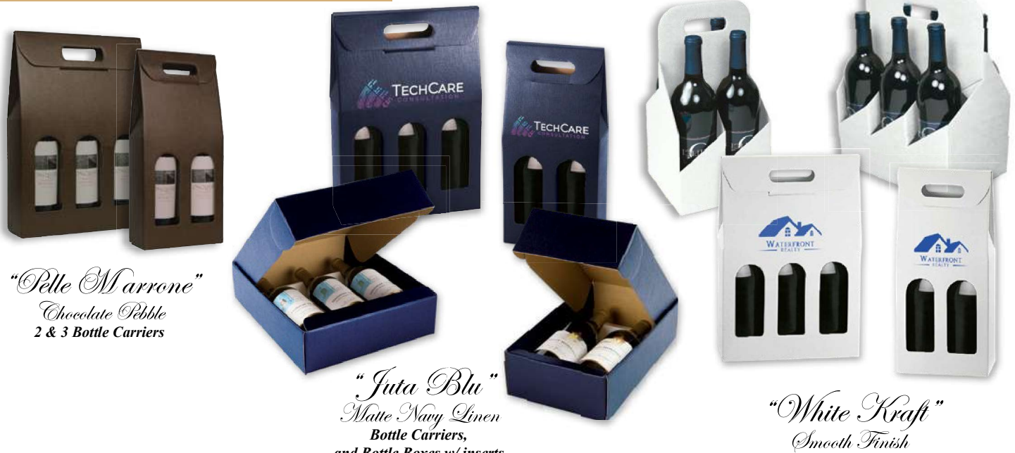
"Pelle Marrone" Chocolate Pebble 2 & 3 Bottle Carriers