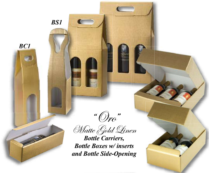
“Oro” Matte Gold Linen Bottle Carriers, Bottle Boxes w/ inserts and Bottle Side-Opening