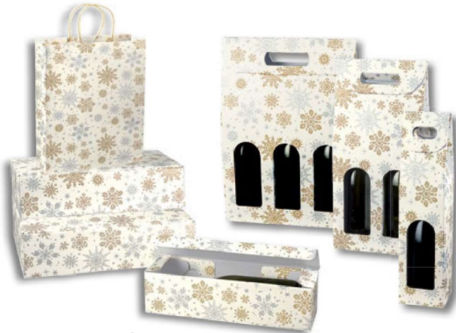
“Alpine Snowflake” Linen Embossed 1, 2 & 3 Bottle Carriers, Boxes, & Bags