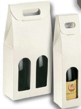
"Sfere Bianco" Bubble Texture 1 & 2 Bottle Carriers